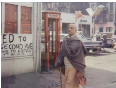
New York City 1966

6,000 Vaishnava Festivals held – Rath Yatra, Janmastami, Diwali etc.