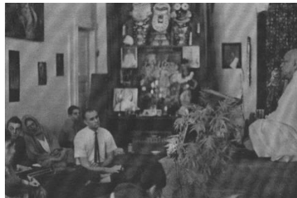
San Francisco 1967